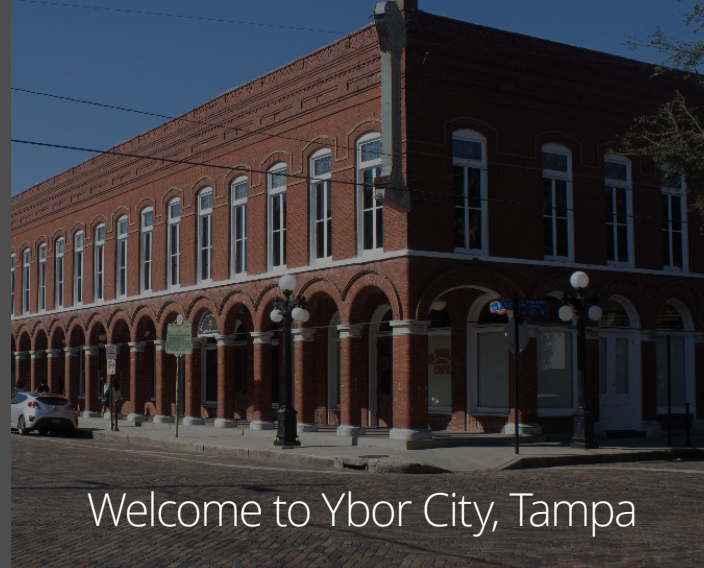
Welcome to Ybor City, Tampa

SOFWERX was created under a Partnership Intermediary Agreement between Doolittle Institute and the United States Special Operations Command (USSOCOM). Located in Tampa, FL, SOFWERX has a very dynamic environment designed to create a high rate of return on collision for all participants. Through the use of our growing ecosystem, promotion of divergent thought, and neutral facilitation, our goal is to bring the right minds together to solve challenging problems.